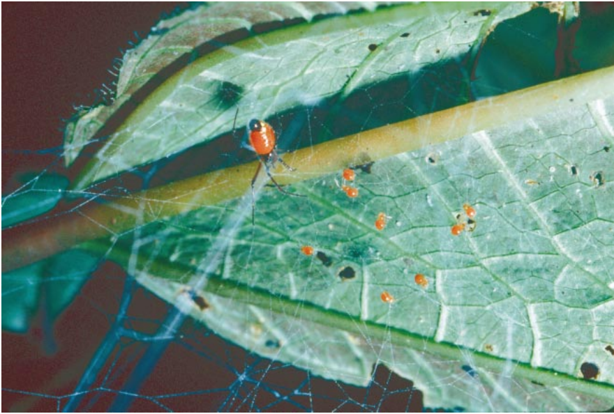
Figure 1.— Chryso nigriceps . Juvenile spiders in web with adult female, Agua Bonita, Colombia.